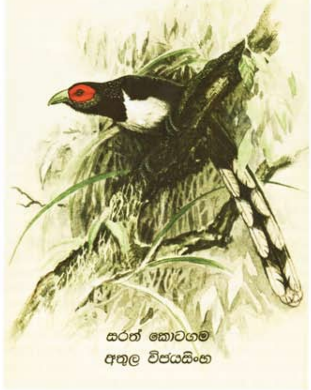
සරත් කොටගම අතුල විජයසිංහ