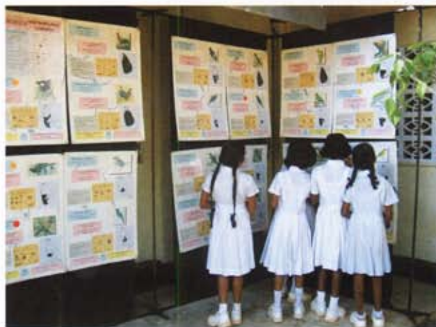
Plate 6: FOGSL's Environment Education Programme; probably the longest running such programme in Sri Lanka

'Conservation Through Birds' at the Mahapola Education and Trade Exhibition organized by the Mahapola Graduate' Foundation and held in schools island wide, in an attempt to reach a broader target group. Further, FOGSL has launched a programme titled '2000 school clubs by 2000' to establish a network of 2000 school bird organizations by the year 2000. This programme gave birth to many conservation conscious young naturalists all over the island.