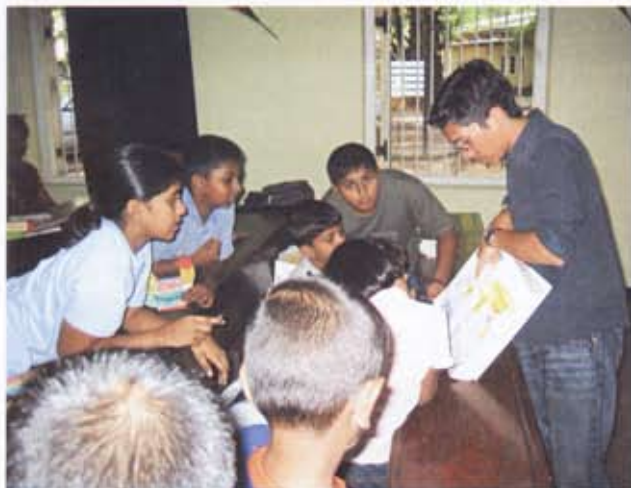
Plate 2: FOG Kids; young naturalists learning from a foreign Intern student

On 19th October 1997 the first branch of FOGSL was established in Galle, Sri Lanka. In order to support a wide-ranging membership both here and abroad FOGSL entered cyber space in 2003 with the launch of the FOGSL e-group and website ( www.fogsrilanka.org ).