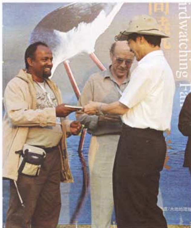
Plate 12: FOGSL has sent a delegation to 'Bird Watching Fair' in Taiwan, which is an annual event for bird watchers in the oriental region

Apart from its links with India, FOGSL was able to make strong links with other ornithological societies of Asia, especially the Wild Bird Society of Japan, and Wild Bird federation of Taiwan. On many occasions FOGSL has worked with these organizations on issues of common interest such as conservation of migratory birds and development of bird tourism in the region.