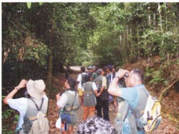
Plate 4: Watching birds at Sinharaja during the members' field trip

Field trips of 01 - 04 days to various locations for bird watching are planned to encourage the members to identify and study birds, in-situ. Three major field workshops of 03 - 05 days are organized annually. The Wader Study Workshop at Bundala, the Workshop on Field Study Techniques including Bird Ringing at Buttala and the