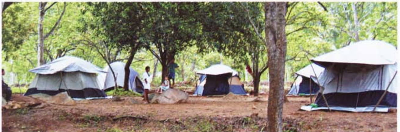
Plate 9: Camping facilities developed at Buttala OFSMC

FOGSL has also initiated single species studies during the last decade. Two study programmes have been conducted so far where the biology and ecology of two endemic species, the globally threatened Sri Lanka Blue Magpie and near threatened Sri Lanka Spot winged Thrush were studied. A vast amount of information was