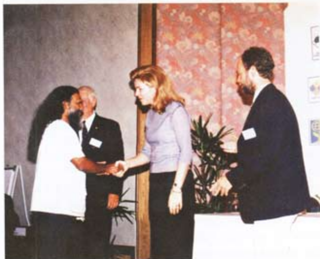
Plate 14: FOGSL president receiving the 'BirdLife Conservation Achievement Award' from Her Majesty Queen Noor of Jordan, Honorary President of BirdLife International.

When Sri Lanka was devastated by the Tsunami in December 2004, FOGSL played a major role in re-establishing the natural habitats and community life in Tsunami struck areas like the RUK (Rakawa, Ussangoda and