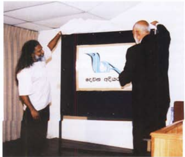
Plate 13: Launching of the IBA Phase II: Hon. Minister A.H.M. Fowzie (Minister of the Environment and Natural Resources) unveiling the IBA logo.

In 1981 the International Council for Bird Preservation (ICBP) Asia conference was held in Kandy. This was organised by ICBP Sri Lanka, a collective body of a number of local nature organizations including FOGSL. When the ICBP was re-formed as BirdLife International in 1994, it recognized FOGSL's active participation in conservation. Dr. S.W. Kotagama was elected Technical Advisor for Asian Relations. The launching of the Asian Red Data Book (ARDB) program and data compilation commenced in 1995. FOGSL was Sri Lanka's counterpart in this program and was a step ahead compared to the other countries in the region. Recognizing FOGSL's capacity by its role in the ARDB-Threatened Birds -Sri Lanka component in data collection and compilation, FOGSL was given the status of "National Affiliate" followed by 'country representative' of BirdLife International.