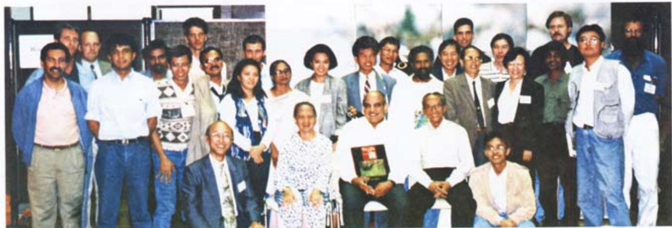
Plate 11: Delegates who participated at the 1st meeting of the BirdLife International in 1994 at Roseinhiem, Germany. FOGSL represented Sri Lanka at this event.

In 1977, Dr. Salim Ali, an eminent ornithologist was invited to Sri Lanka as FOGSL established it's link with the Bombay Natural History Society (BNHS), the largest and the most prominent institute for natural history in the region. This bond enabled FOGSL to conduct many training sessions, including bird ringing, for it's members.