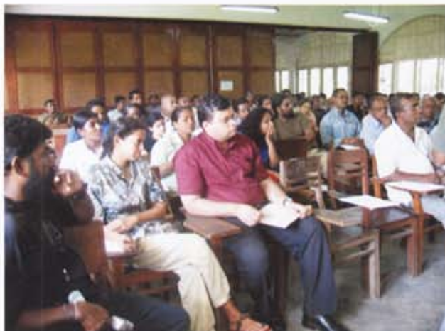
Plate 3: Members gathered at a monthly meeting

A number of programmes are organized for the members, thus creating an awareness of our feathered friends. The Sinhala lecture series conducted by FOGSL spreads the message of conservation of birds to a larg-