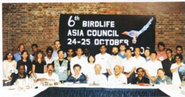
Plate 10: FOGSL hosted 6th BirdLife Asia Council Meeting in year 2000 at Ranwell Holiday Resort

In 1997, members of the FOGSL carried out a research expedition in the Delwala Forest Reserve in collaboration with a team of students from the Cambridge University. Further, FOGSL conducted number of short-term studies including biodiversity surveys in important