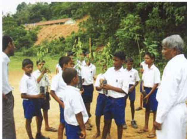
Plate 5: Preparing to plant a tree. School's Analog Forestry Programme in Southern Province

FOGSL also conducts many programs to create awareness among future naturalists and conservationists (especially school children) under the theme